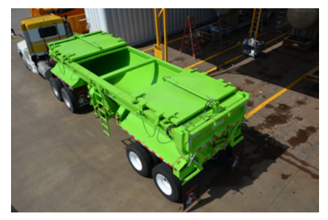
Dual Hydraulic operated sliding doors with complete cover enclosure makes this the ideal drill cutting hauling trailer.