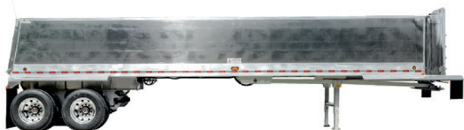
S-85 STRAIGHT BODY END DUMP