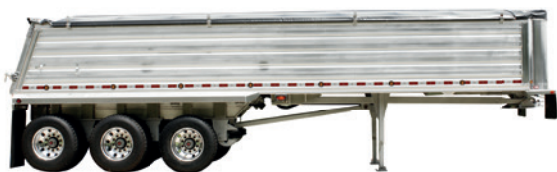
32' ALUMINUM END DUMP QUARTER FRAME, TANDEM OR TRI-AXLE