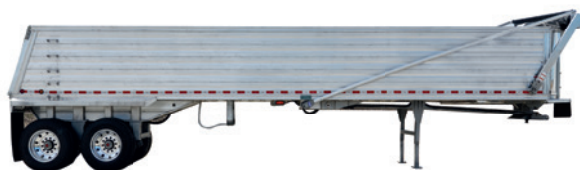
39' ALUMINUM END DUMP DOUBLE WALL