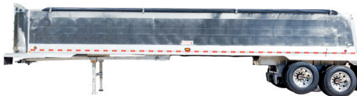
ALUMINUM END DUMP