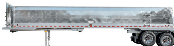
T-91 TAPERED BODY END DUMP