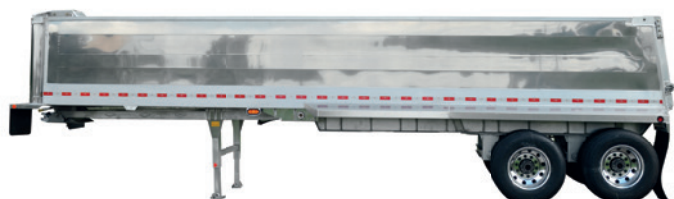
SUPER LIGHTWEIGHT SINGLE WALL END DUMP