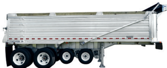
26' QUAD MINI END DUMP