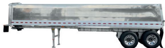
32' FRAMELESS END DUMP