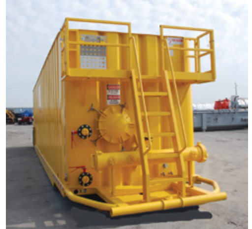
Connecting Crosswalk Frac Tanks Patent No. US 7,762,588 B2