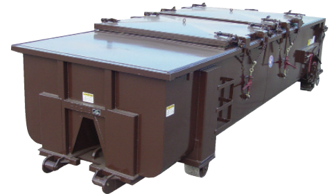
SUPER DUTY SLIDING LID CONTAINERS