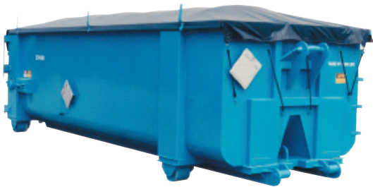
SUPER DUTY OPEN TOP SOLID WASTE CONTAINERS • OPTIONAL COVER