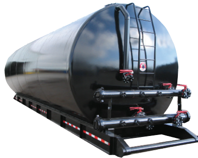
SKID MOUNTED STEEL TANKS