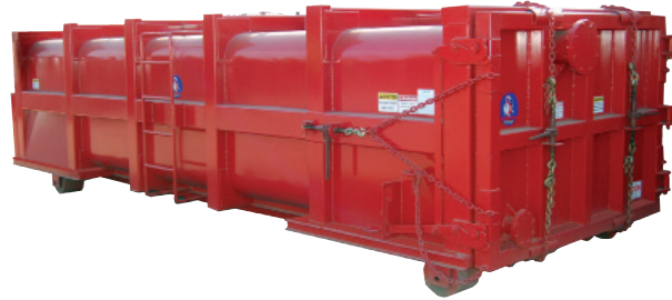
VACUUM BOX CONTAINERS