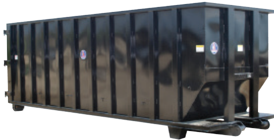
OPEN TOP SOLID WASTE CONTAINERS